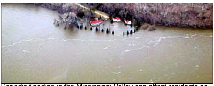
Periodic flooding in the Mississippi Valley can affect residents as far north as Minnesota and as far south as Louisiana. In May 2001, the Mississippi River flooded this house south of Red Wing, Minnesota.

To determine what rivers looked like prior to a flood event, Brakenridge's team used MODIS data to develop a baseline map for many of the world's major rivers. Based on the reflective characteristics of each pixel in an image, the researchers can distinguish water from other land cover types. "It's important to have a standard reference so that when we map a flood, we don't mistakenly include areas that are normally under water, such as lakes, reservoirs, or wetlands," he said.