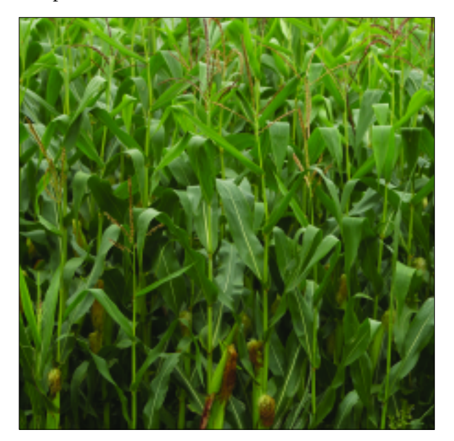
Irrigation allows farmers to grow water-thirsty corn on the relatively arid plains of the western and midwestern United States. But overuse of groundwater supplies can quickly deplete sources like the Ogallala aquifer, which underlies much of the Great Plains.

In May 2006, Colorado State Engineer Hal Simpson ordered the shutdown of 400 wells