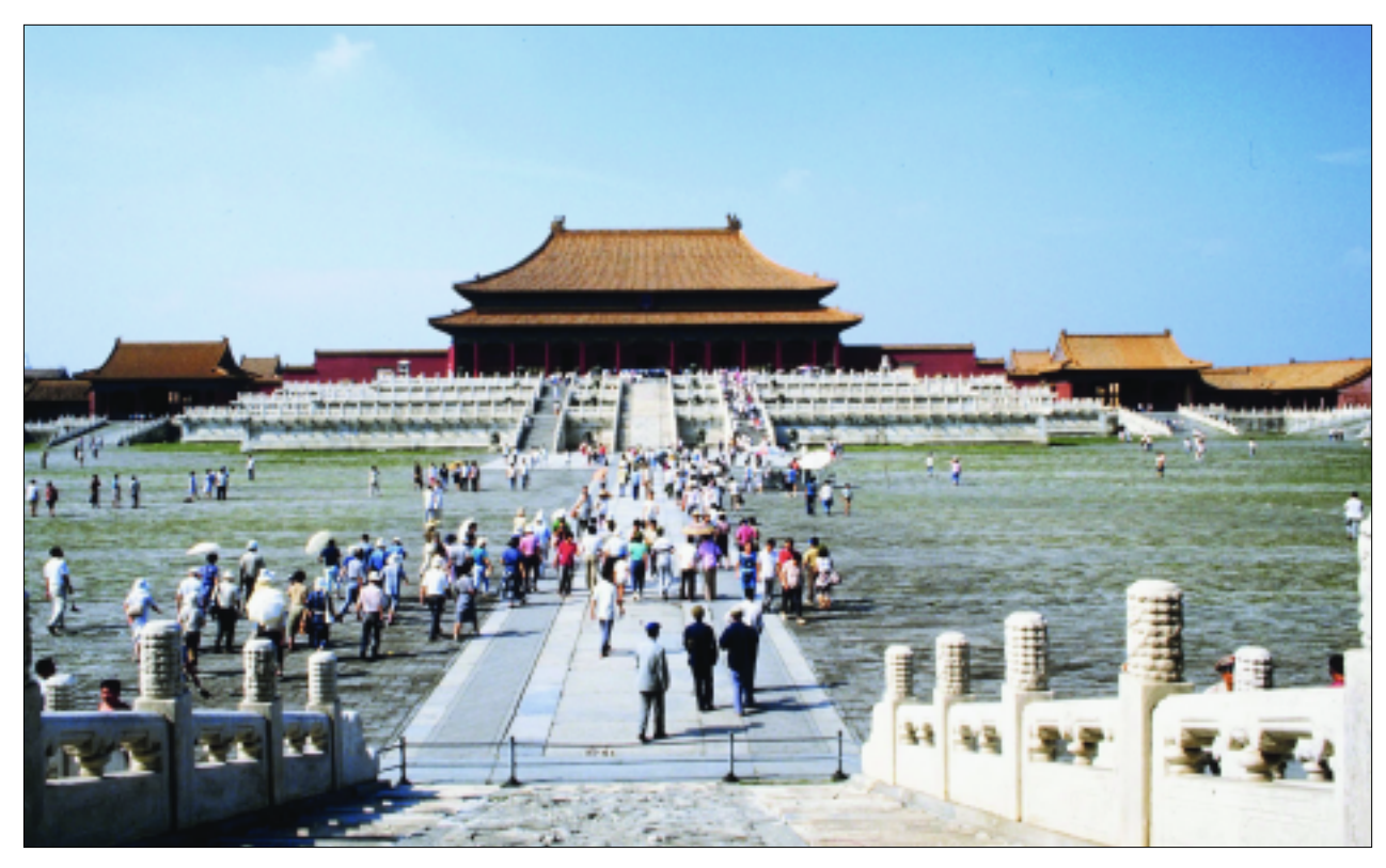
This photograph of the Hall of Supreme Harmony in Beijing's Forbidden City was taken on a relatively clear day, but air pollution often obscures much of Beijing's famous architecture.

Wang said, "OMI is perfect for this type of work. Unlike previous instruments, it sees all parts of the globe daily, which we really needed for a project covering such a short event." Another advantage of OMI is its small footprint, around twenty-four by thirteen kilometers (fifteen by eighteen miles). "The urban center of Beijing, where the traffic restrictions were in place, is about fifty by