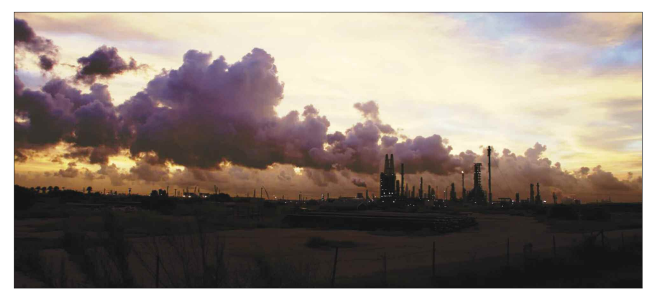
This photograph, taken at dawn in August 2006, shows an oil refinery in Corpus Christi, Texas. Emissions from the petrochemical and shipping industries that operate along the coast often affect air quality in southeastern Texas.

Officials are discovering that air pollution is not just a local problem, however. Regional and continental air circulation patterns frequently carry pollution from one area to another. But whether pollution is from a local factory or from another state, cities are expected to meet EPA