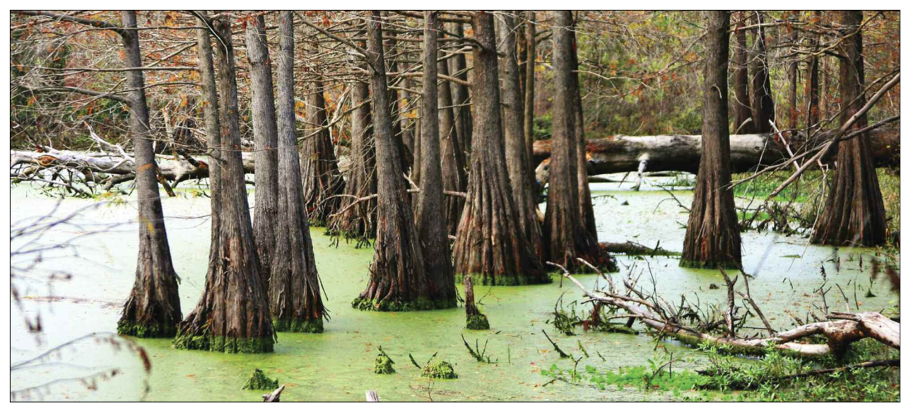
Satellites can detect water-level changes in forested swamps like this bald cypress forest in Louisiana. Swamp water levels are important to ecosystem health.

Zhong Lu, a physical scientist at the Earth Resources Observation and Science Data Center in Sioux Falls, South Dakota, was drawn to the delta's unique, if complex, geological processes.