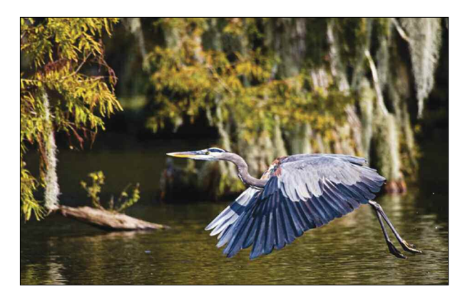
Louisiana's interconnected swamps and bayous provide habitat for a variety of wildlife, such as this great blue heron.

Scientists have used in situ gauge measurements in wetlands to assess flood hazards and record waterlevel changes. Lu said, "But this method is cost prohibitive. Insufficient measurements cause significant errors in hydrologic simulations. Satellite sensors can be a cost-effective tool to monitor water-level changes. Satellites take