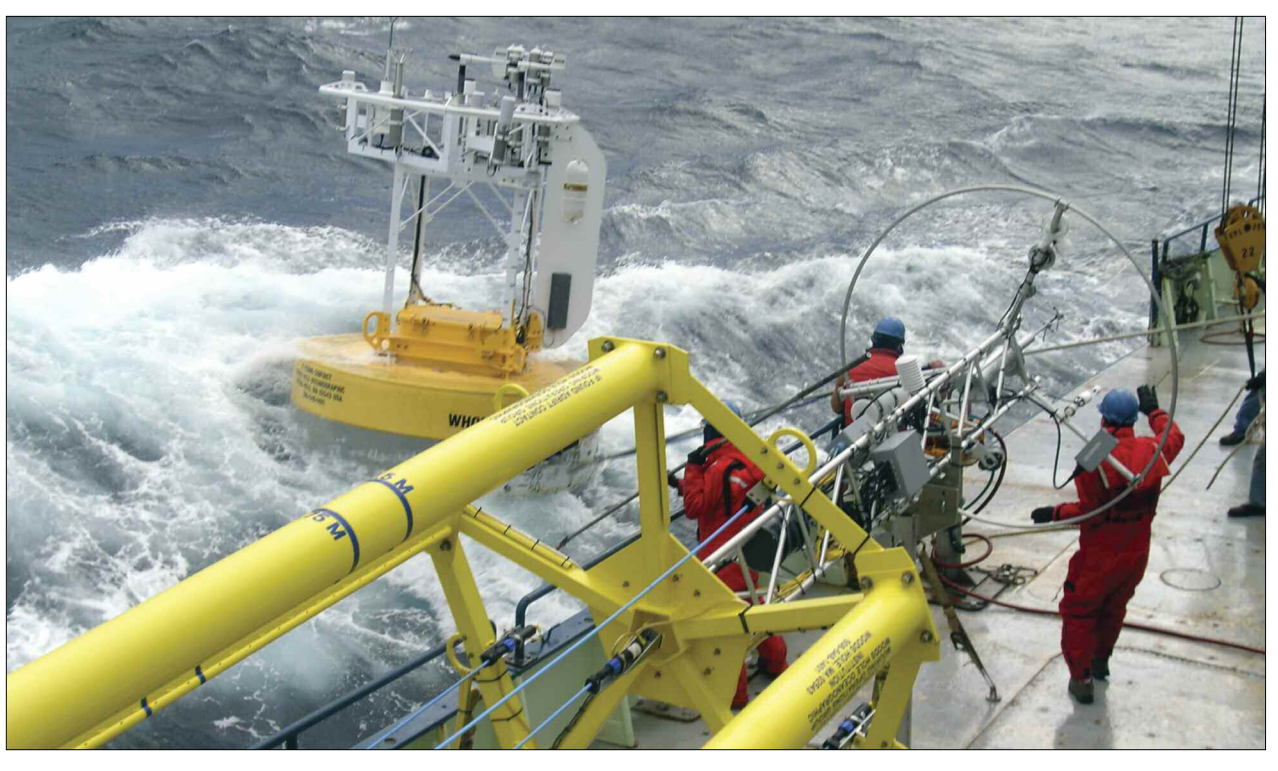
Crew members recover a buoy which broke loose in the Gulf Stream. The instrument shown along the shiprails was later destroyed in a storm.

Terry Joyce, an oceanographer with the Woods Hole Oceanographic Institution, was aboard the ship during the cruise. He said, "During the night, as we limped toward Bermuda, we took a big wave over the bow and had water up on the bridge. The wave destroyed the spar buoy, which we'd gone to such effort to recover just the day before so it wouldn't get damaged at sea." The wave snapped seven of the cargo straps and swept parts of the buoy overboard; heavy battery cases rolled around on deck threatening to short out and spark a fire. The crew spent much of