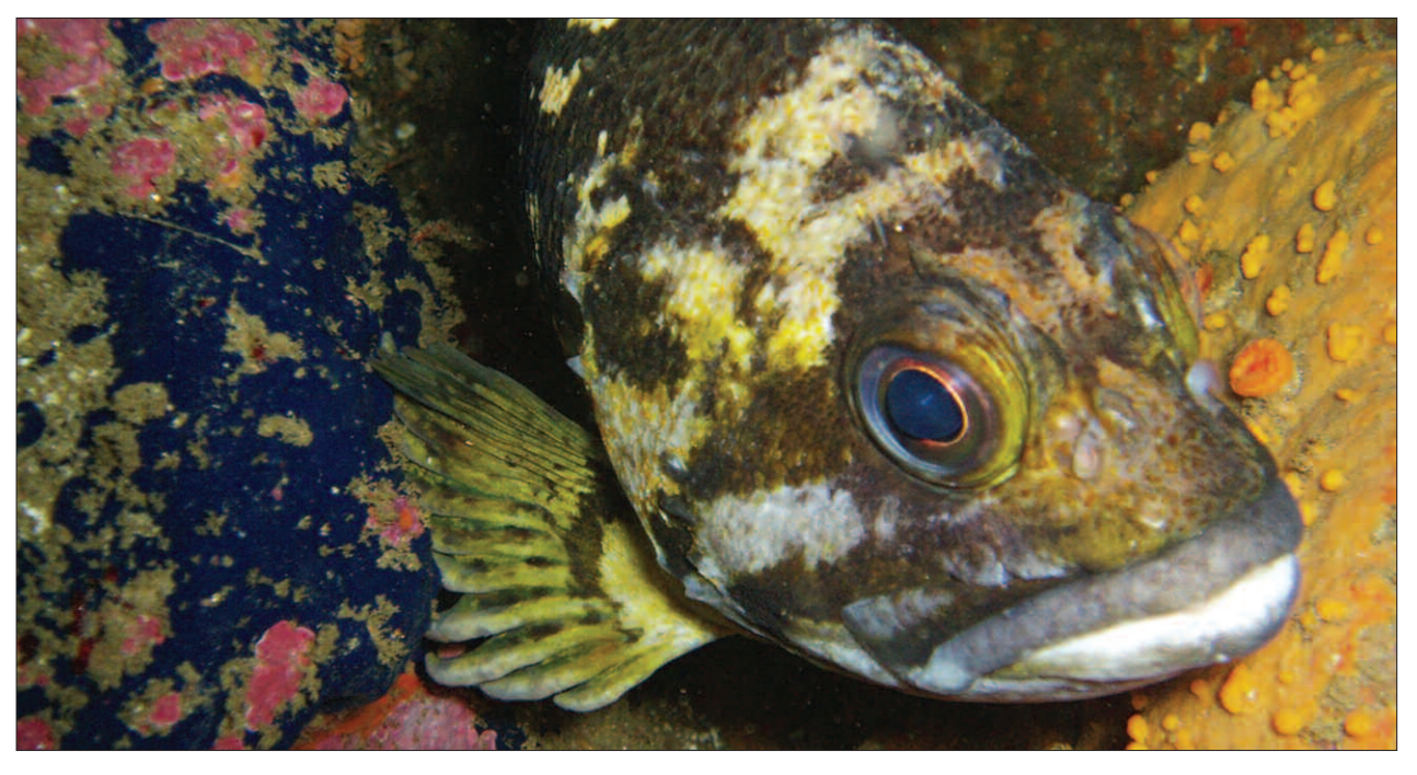
The ocean food web is filled with little-known varieties of fish and marine animals; here, a black and yellow rockfish swims in Monterey Bay, California.