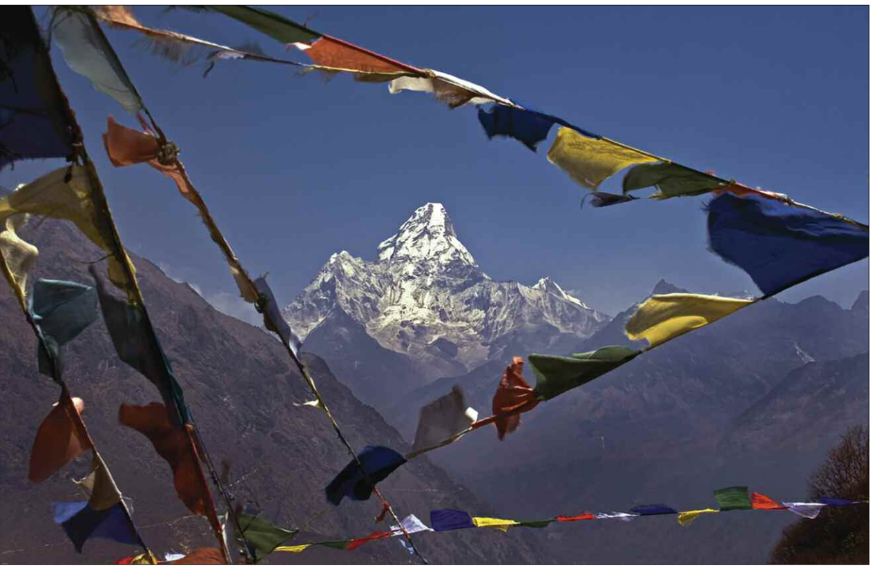
Prayer flags frame Ama Dablam Peak in the Nepalese Himalaya. Understanding what is happening to the glaciers is critical not just for the region's water resources, but also because of the cultural significance of both the mountains and the glaciers.

At the heart of this birthplace are 15,000 glaciers, frozen reservoirs whose meltwater feeds the rivers that flow through the mountains. In fact, the headwaters for India's holy river, the Ganges, issue from the massive Gangotri Glacier system.