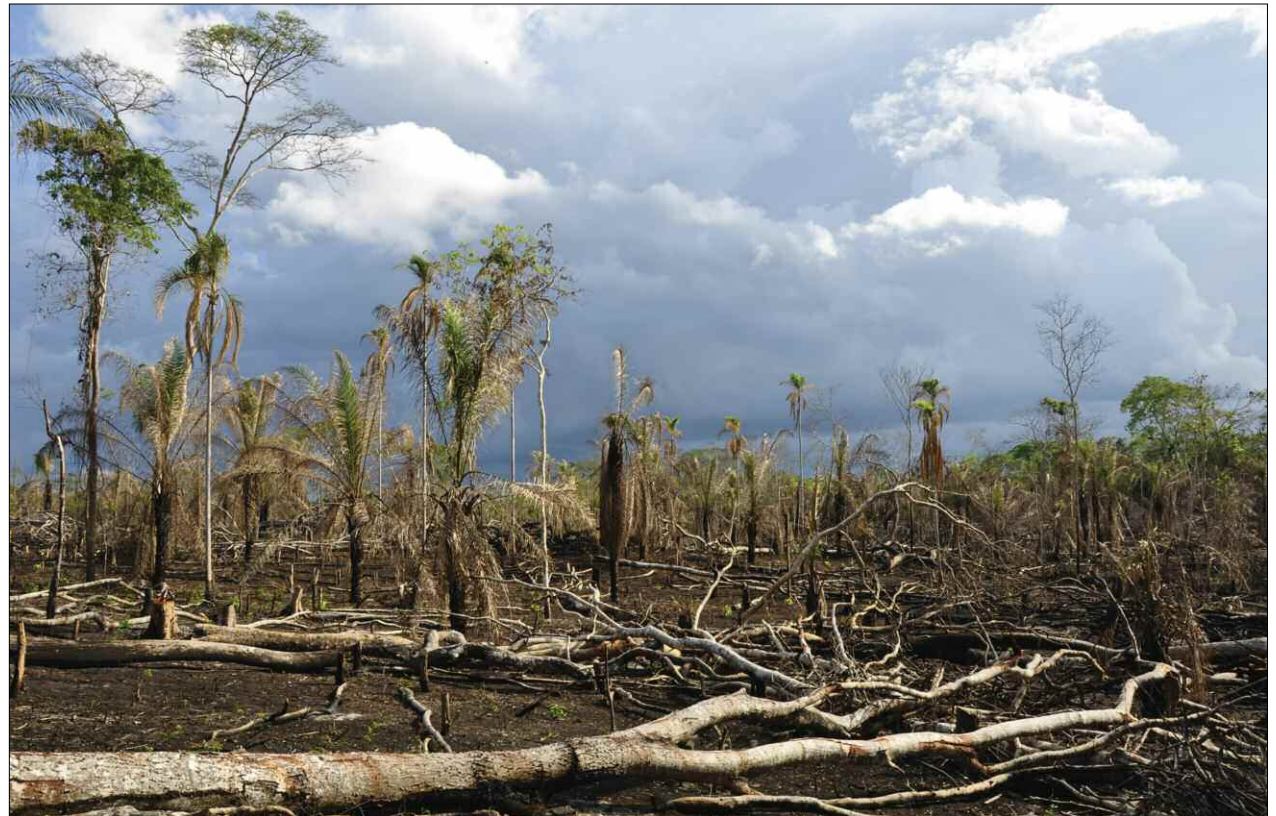
Wide-scale deforestation is a major concern in tropical countries. This forest in Bolivia once hosted diverse animals and plants, and protected rivers and streams from erosion. The release of carbon stored in the forests can tip Earth’s carbon balance.