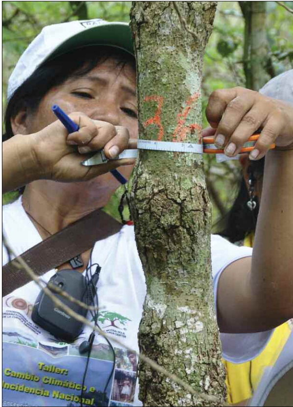
A workshop participant practices stem diameter measurements, near Concepción, Bolivia.

want to know how much carbon they have standing in their forests, because it's worth money to protect it. But these forests are valuable not just in terms of carbon; they are also valuable in terms of biodiversity."