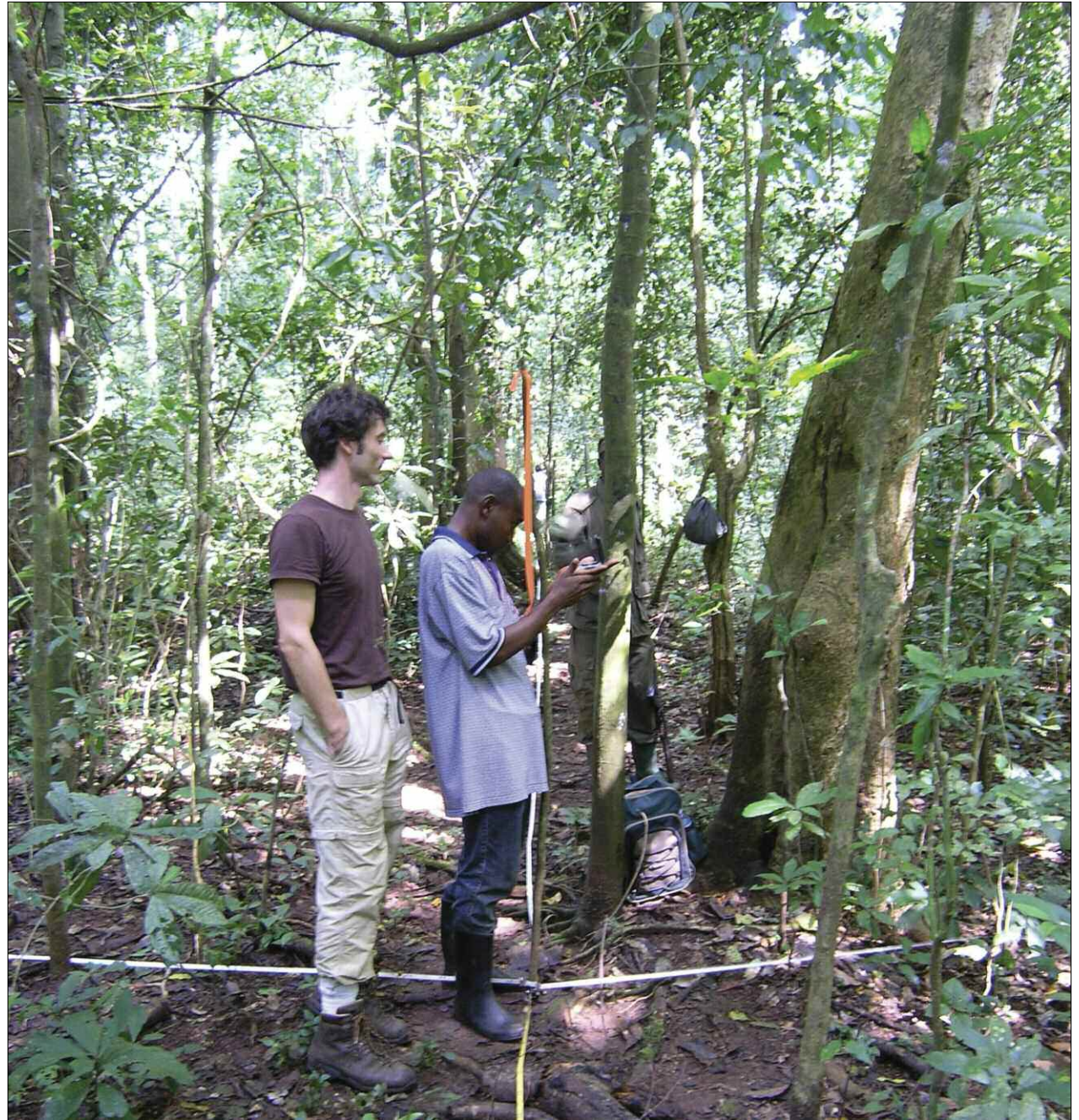
A Woods Hole Research Center (WHRC) scientist, left, shows a Ugandan forest ranger how to measure trees to help calculate how much carbon a forest contains. Measurements from local people are vital in assembling a global satellite view of forest carbon stocks.

These field methods work well on a small scale, but to get a consistent global picture, researchers need a global tool. Satellite data provide this