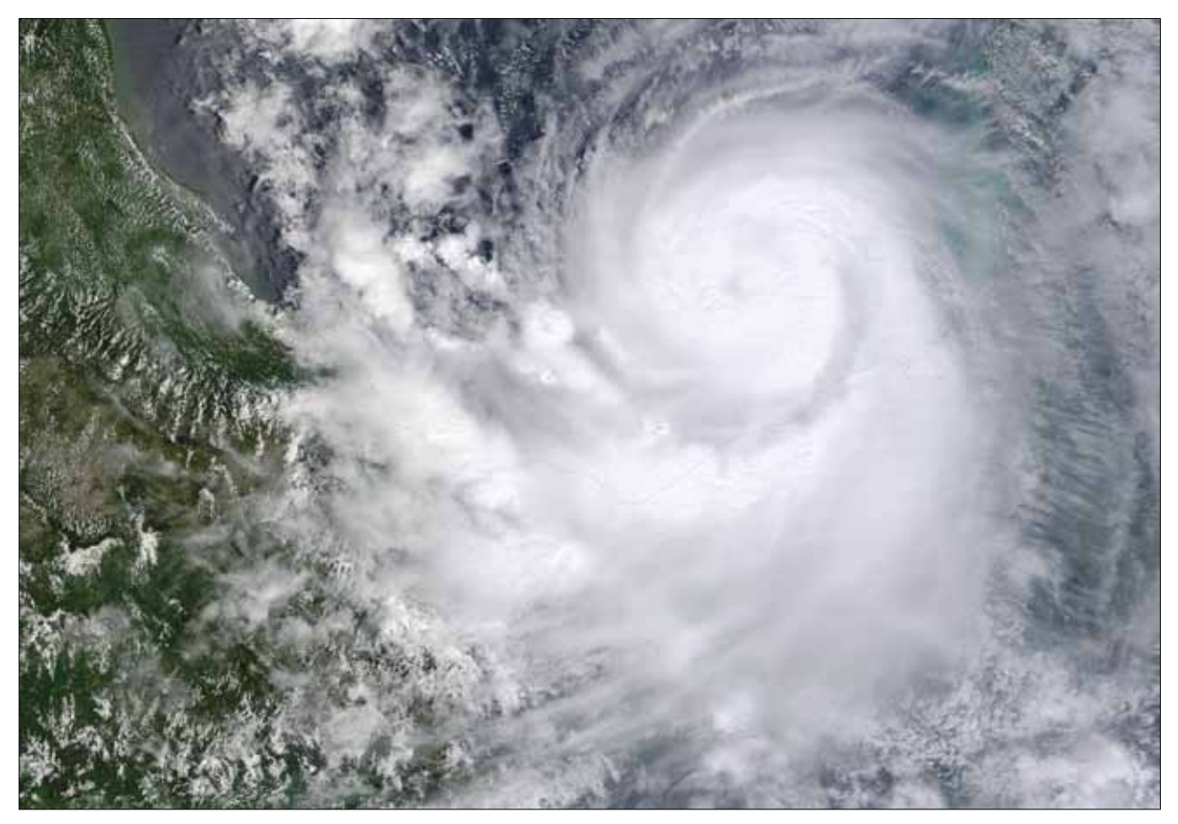
Hurricane Karl thrashes Mexico in September 2010. Karl surprised hurricane forecasters with its rapid intensification from a tropical depression to a Category 3 hurricane.

Braun and Zipser are two of about three hundred scientists, engineers, pilots, and crew who have been pursuing hurricanes to gather more observations through the NASA Genesis and Rapid Intensification Processes (GRIP) experiment. The scientists tracked and studied several storms in August and September of 2010, as they formed over the Atlantic Ocean and either petered out or grew into much larger hurricanes. They took measurements in, outside, and around the storms using sensor-laden airplanes and four NASA satellites watching from space. "GRIP's mission is to understand the physical processes happening in a hurricane, but we will also take