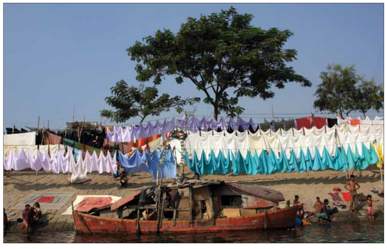
River water is part of life in Bangladesh. Although people usually do not drink from the river, the water is used for cooking, bathing, and washing, and when contaminated it can spread cholera.

Modern medicine has managed to control or eradicate a number of diseases, such as smallpox and polio, which used to kill people around the world. So why does cholera remain untamable? "Cholera is a bacteria that has learned how to