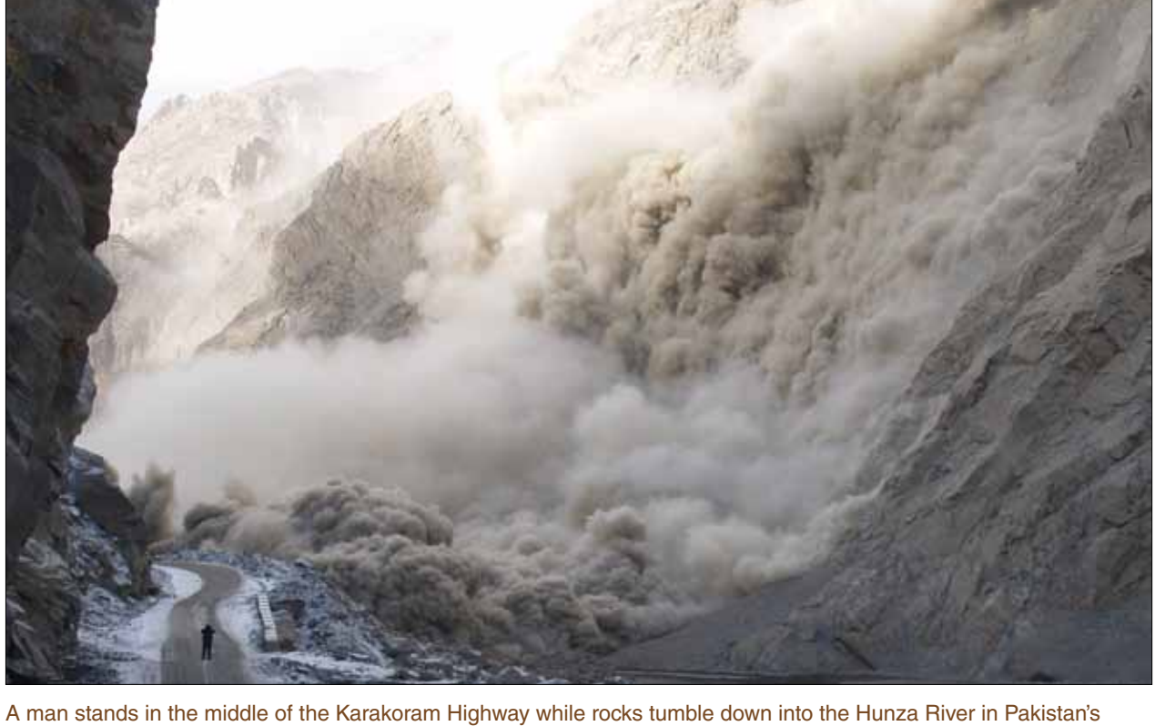
A man stands in the middle of the Karakoram Highway while rocks tumble down into the Hunza River in Pakistan's Gojal region. The rockslide dammed the river and created Lake Gojal, which submerged eleven miles of the Karakoram Highway and isolated several villages.

part of a village and blocked the river's flow. Boulders, rocks, and debris tumbled down the mountainside that day, killing twenty people and damming the river until it swelled and swallowed more communities. In months, the pluggedup river would submerge eleven miles of the Karakoram Highway, turning a thriving region buzzing with trade from the Chinese border into scattered clumps of unconnected villages.