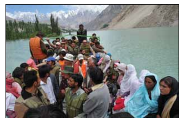
Travelers and locals cram into boats and ferries for the two-hour crossing of Lake Gojal. The snow-capped, jagged peaks of Mount Tupopdan are seen in the background.