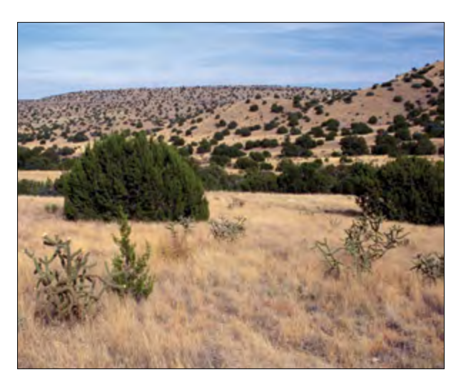
This juniper-covered savanna is one example of a biome in arid New Mexico that includes carbon-sequestering vegetation.

The team's preliminary study focused on two related components, temperature and precipitation, and was a springboard for more complicated investigations to come. It confirmed most of what they expected. They found that the ability of these ecosystems to store carbon was indeed reduced under hotter and drier conditions. As temperatures rise, trees become stressed. And when less water is available, they are stressed further, less able to photosynthesize: breathe