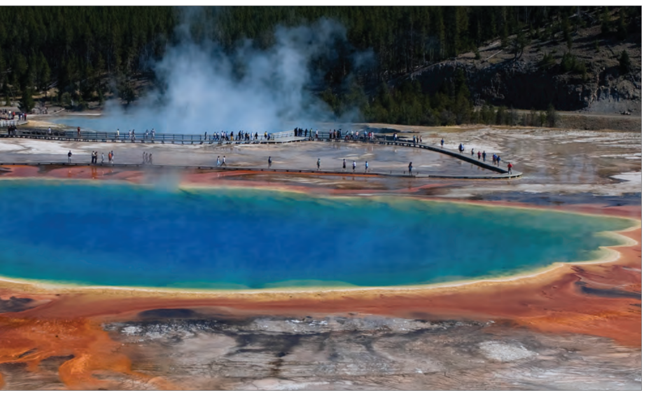
Thermophilic bacteria give Grand Prismatic Spring in Yellowstone National Park its many hues.

People like to talk about the potential for a massive eruption at Yellowstone, wiping out the