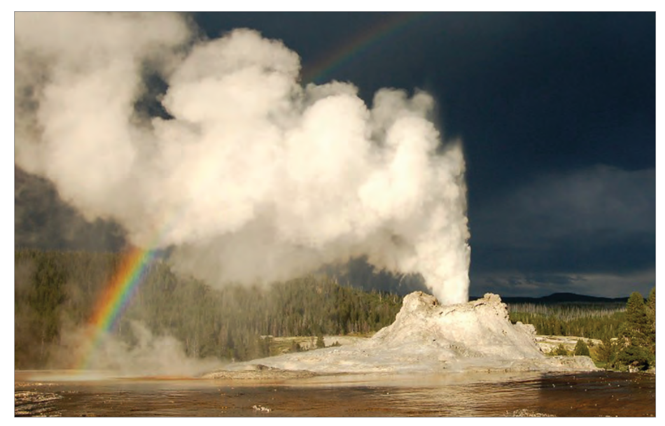
A rainbow stretches over Castle Geyser in the early evening.

Vaughan is interested in what changes in thermal activity can say about volcanoes. "Thermal anomalies often precede eruptions, but it is usually after the fact that we realize this," he said. While the park has placed sensors at some locations, it is impossible to monitor on foot Yellowstone's more than 10,000 geothermal features spread over 3,472 square miles. Most