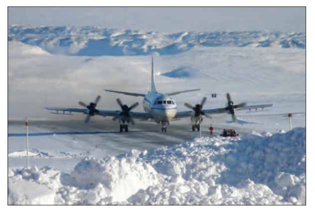
The NASA P-3B aircraft arrives at Thule, Greenland. The aircraft carried Operation IceBridge instruments over the Arctic to study changes in sea ice, glaciers, and ice sheets.

Sea ice freezes not only because the air above it is cold, but also because the ocean below it is cold.