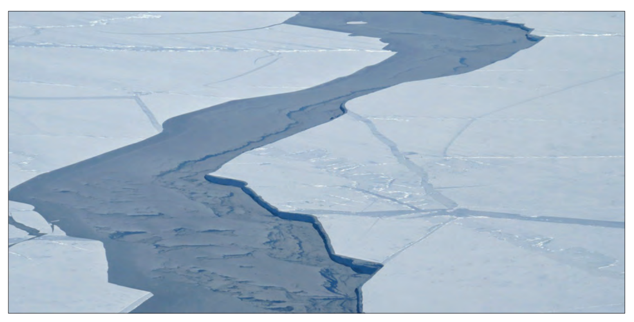
Ice re-grows in a lead between two sea ice floes in the Beaufort Sea, Arctic Ocean, in March 2013.

The loss of Arctic sea ice signals the warming that has been stronger in the Arctic than anywhere else on Earth. At the end of summer 2012, sea ice had shrunk to half its former extent compared to the average from 1979 to 2000, more than a million square miles less. The ice