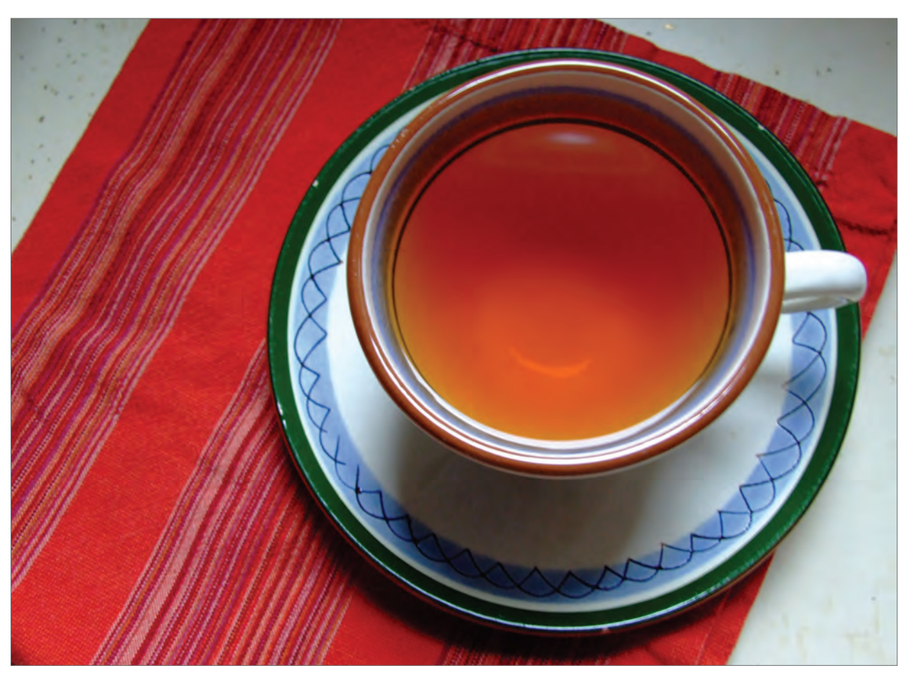
Assam tea is known for producing a reddish cup of tea with an astringent flavor. It is grown exclusively in the Assam region of India.

Whether consumed British-style with milk, Moroccan-style with mint, or with yak butter