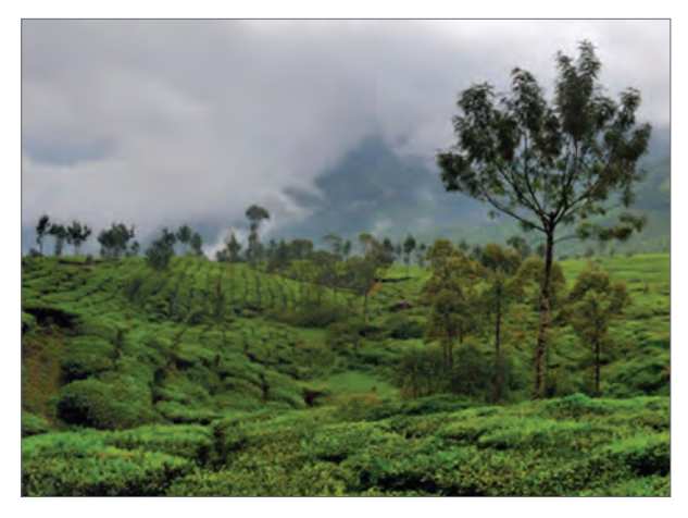
Tea is the most widely consumed beverage in the world, and is typically grown on massive plantations such as this one in Munnar, India.