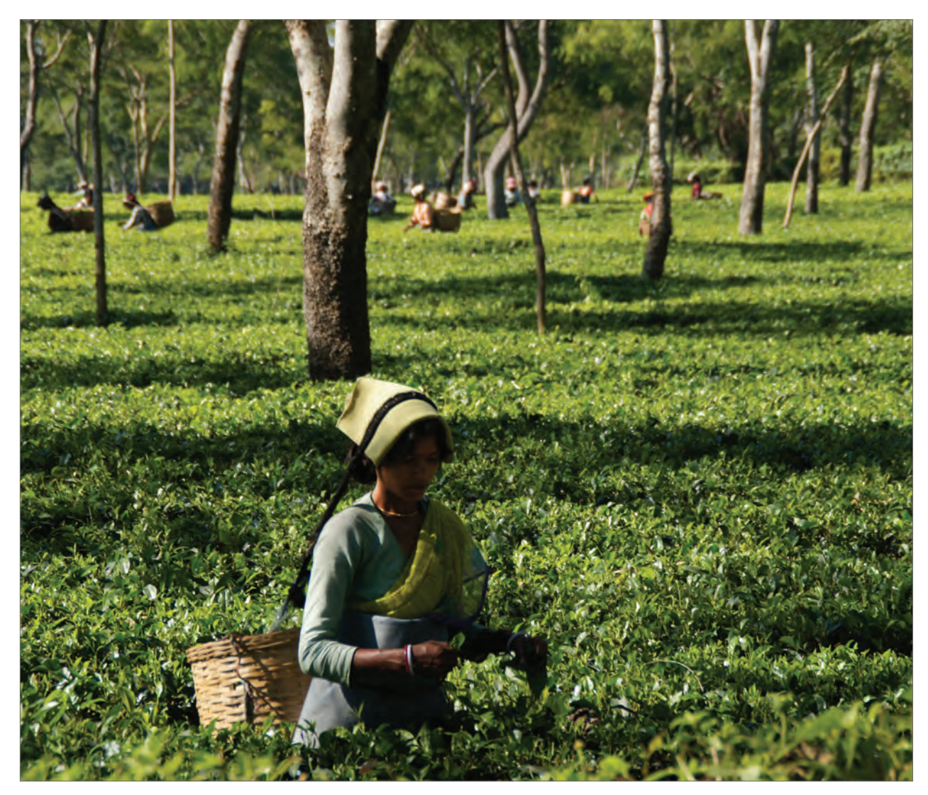
Most tea leaves are still harvested by hand. Tea trees are pruned to waist height so pluckers can easily reach the leaves.