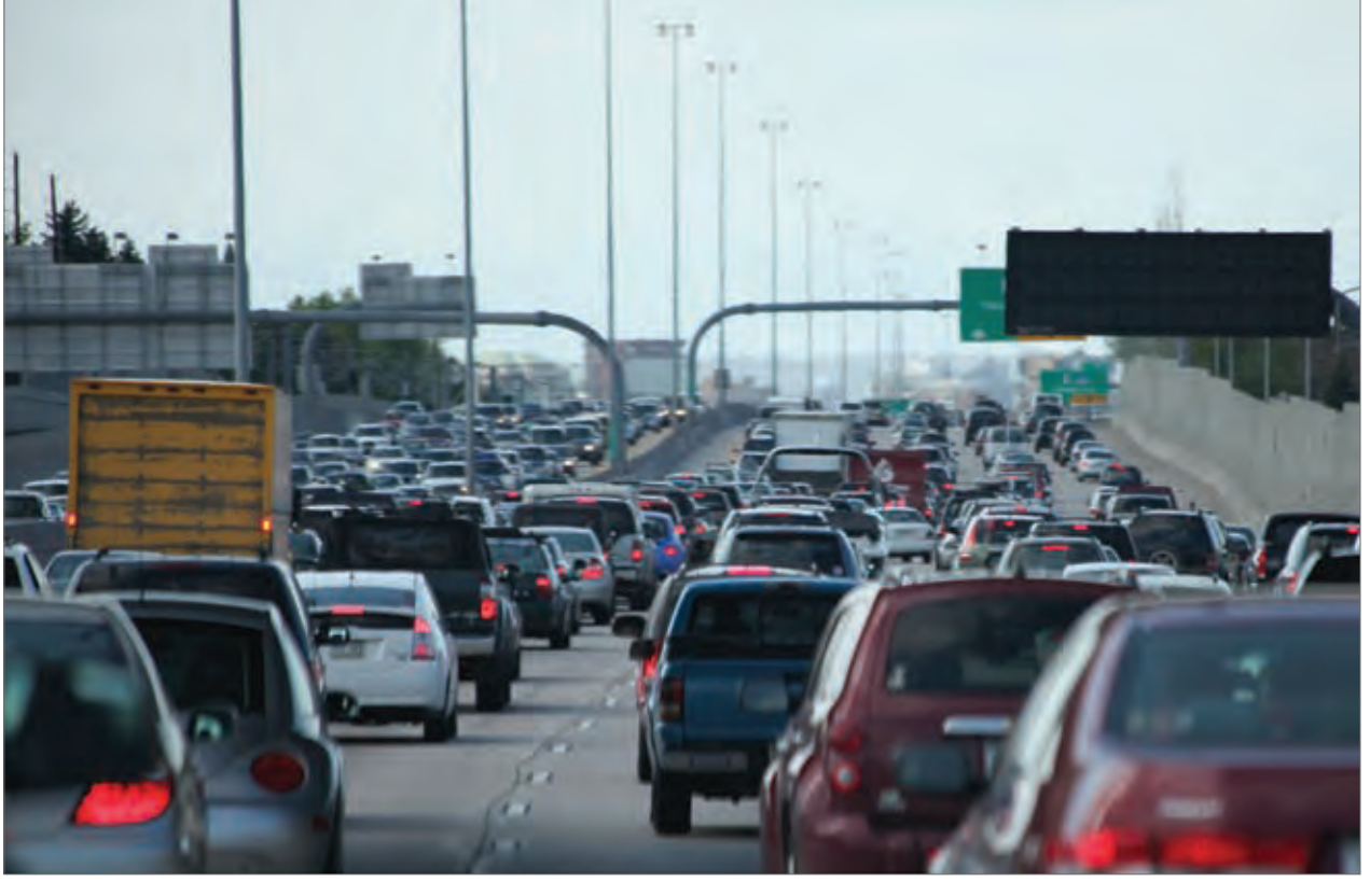
Vehicles emit many of the chemicals that cause Denver's brown cloud of air pollution.

Denver is part of Colorado's Front Range—a north-to-south string of cities nestled against the Rocky Mountains. Unique airflow patterns frequently trap air pollution, curdling it into a dense, visible layer. In addition, researchers have long known that Denver's air quality problems were traveling into the mountains and