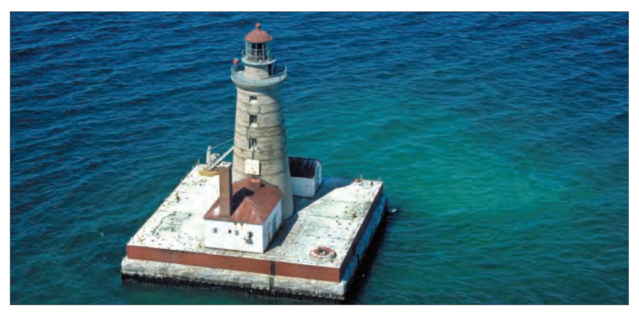
This aerial view shows Spectacle Reef Light on the northwest side of Lake Huron, 11 miles east of Bois Blanc Island.

Precipitation is one driver of year-to-year fluctuations, but Blanken suspected another cause. After observing evaporation in the Great Slave Lake, an extensive lake in northern Canada, Blanken had a hunch evaporation may also play a major role in the Great Lakes' water cycle. Understanding how evaporation works and what it contributes to lake-level changes would